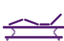
Height Adjustable 22-66cm