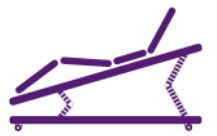
Trendelenburg and Reverse Trendelenburg