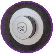
Triple USB charging station