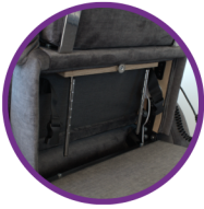
Easy access doors at back of system allowing easy servicing.