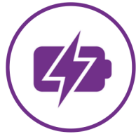
Extremely long charge battery back-up with digital charge meter.