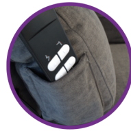
Hand control pouch