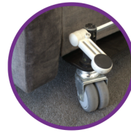
Central locking with dual wheel system allowing the chair to be moved effortlessly.