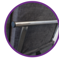
Caregiver push bar.