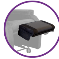
Heel pressure relief