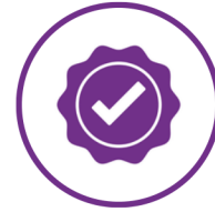
3 Year Warranty*